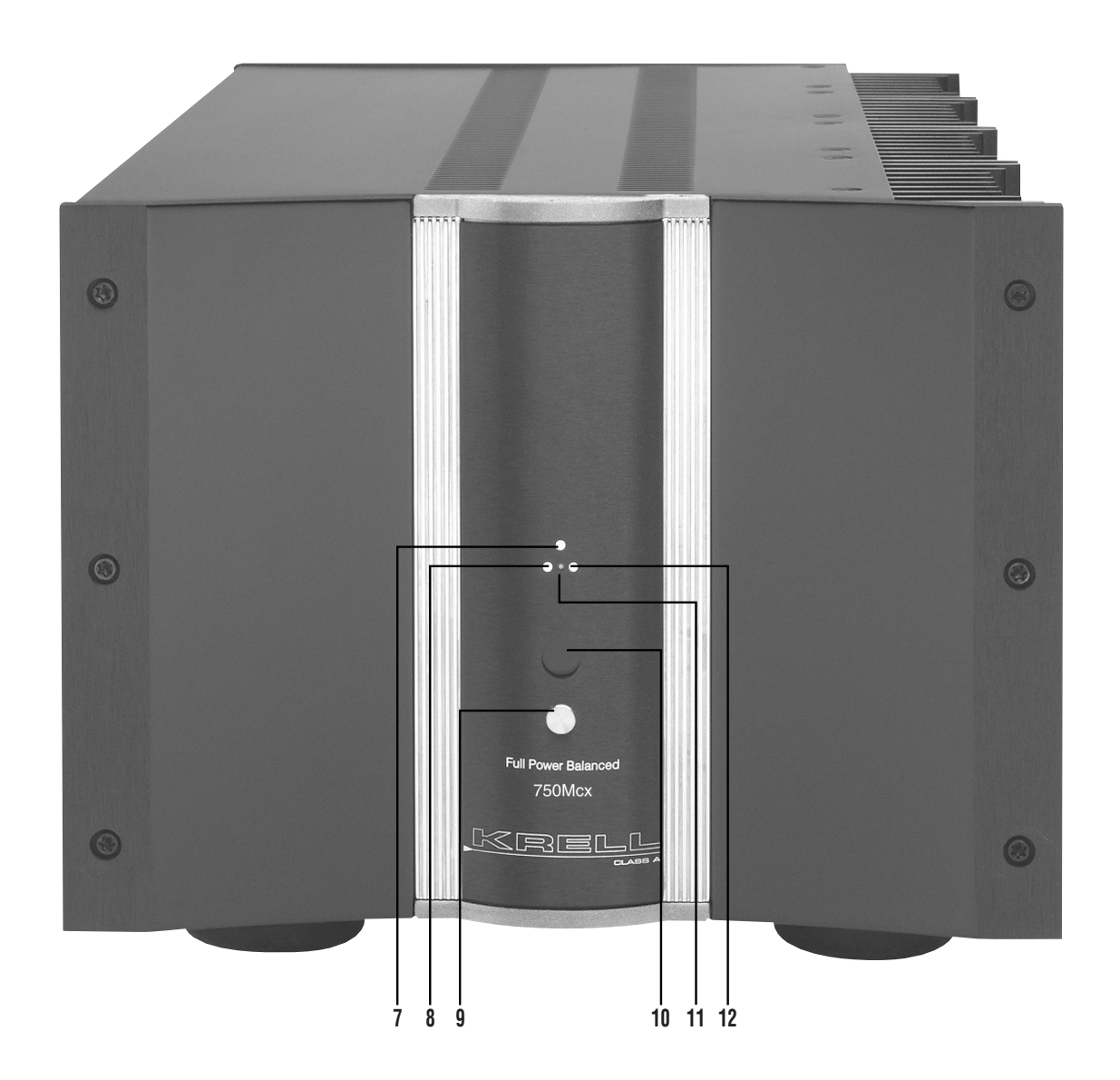
FIGURE 2 FULL POWER BALANCED MONAURAL AMPLIFIER FRONT PANEL