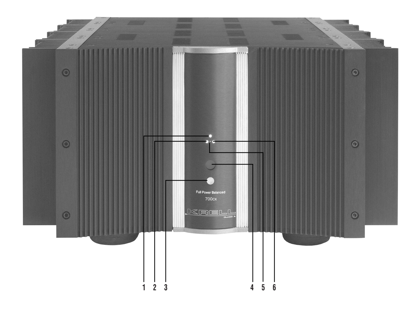
FIGURE 1 FULL POWER BALANCED STEREO AMPLIFIER FRONT PANEL